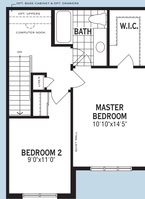
Third Floor Plan 2 Bedroom